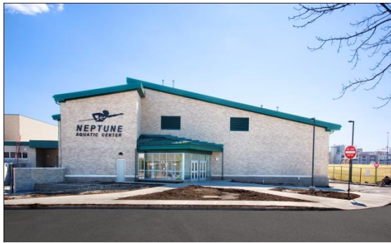
Neptune Aquatic Center

The Aquatic Center is attached to the back of Neptune High School. The address for Neptune High School is 55 Neptune Blvd, however, to access the facility – you must turn onto Heck Avenue. On the left hand side, you will see the glass entrance to the facility with a separate entrance.